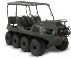
AURORA PRO 950 XT 8x8