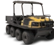
CONQUEST PRO 800 XTX 8x8