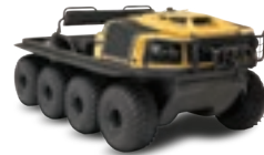
CONQUEST PRO 800 XT 8x8