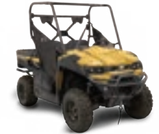
MAGNUM PRO 500 XTX