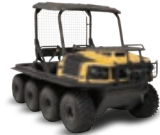
CONQUEST PRO 800 XTL 8x8