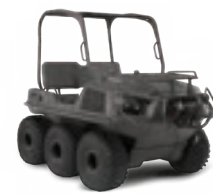
FRONTIER PRO 700 XT 8x6