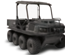
CONQUEST PRO 950 XTX 8x8