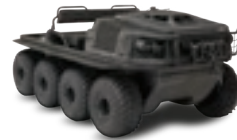
CONQUEST PRO 950 XT 8x8