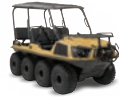
AURORA PRO 800 XT 8x8